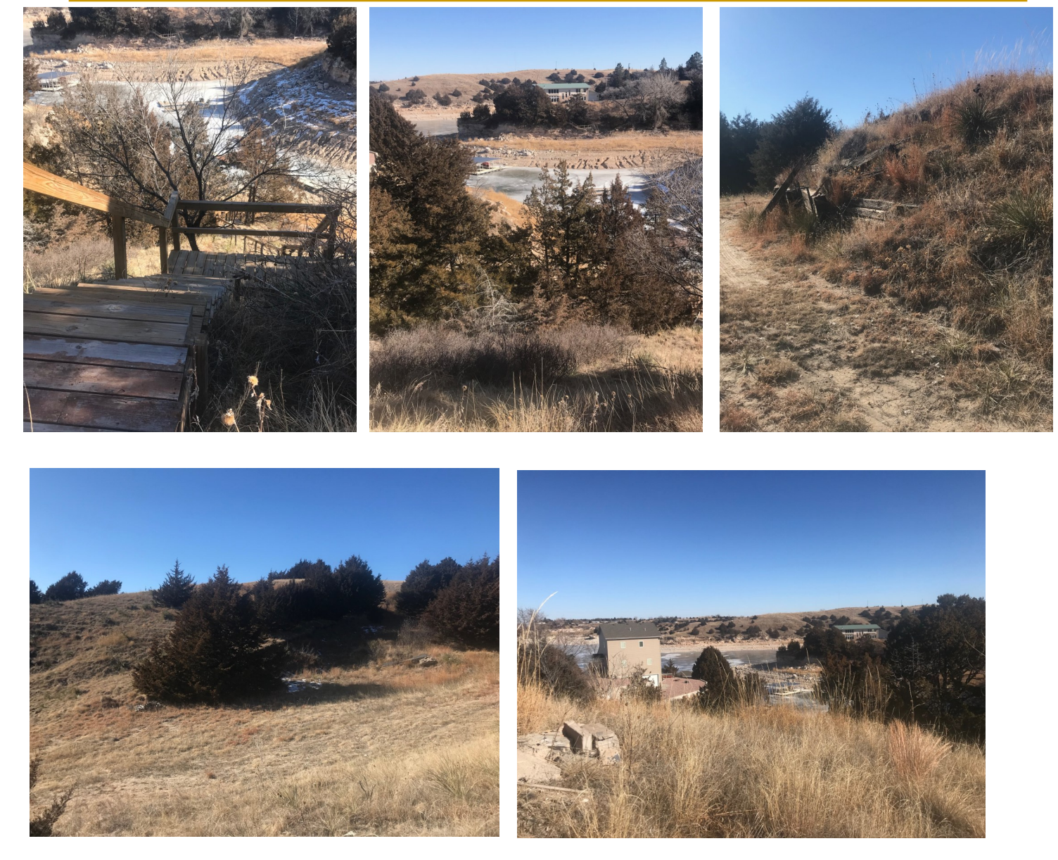
Structure has been demolished and

Information believed to be accurate, but not guaranteed